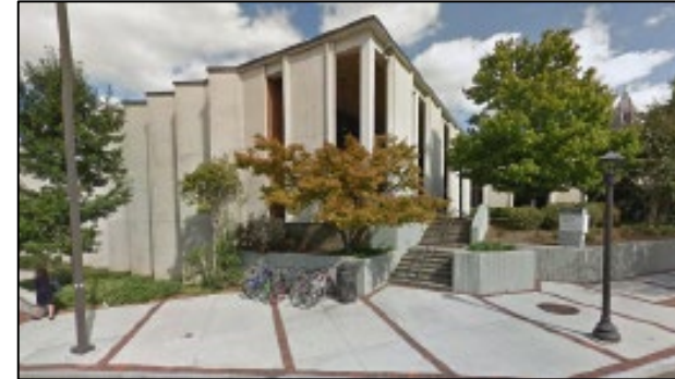
Front of Weber Building